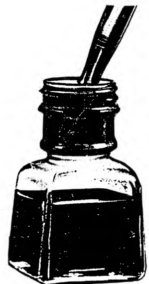
When bottle is quickly returned to its regular base, well retains generous supply of ink.

Well-Top is packed 3 dozen bottles to a carton in the following 6 assortments: